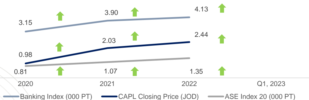
Capital Bank Share vs ASE 20 and Banking Index (Year End Closing Price)