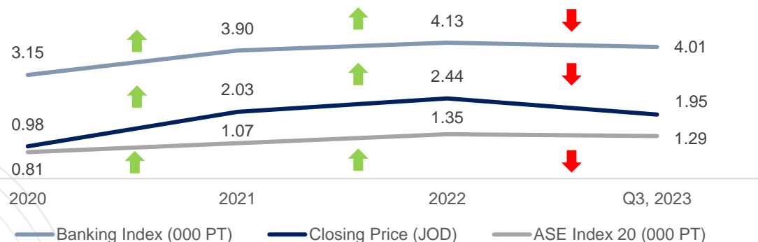
Capital Bank Share vs ASE 20 and Banking Index (Closing Price Q3, 2023)