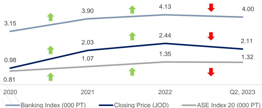
Capital Bank Share vs ASE 20 and Banking Index (Closing Price Q2, 2023)