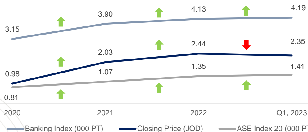
Capital Bank Share vs ASE 20 and Banking Index (Closing Price Q1 2023)